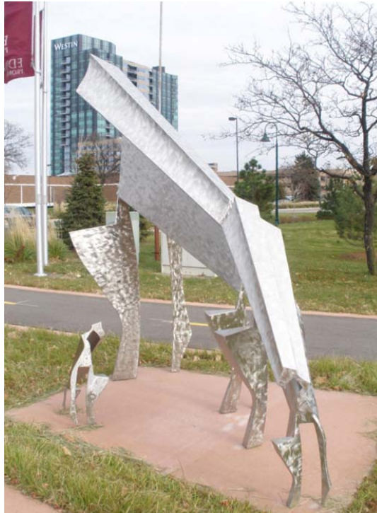
Gyr Family Cycle by Perci Chester on the Promenade near 70 th Street, People's Choice Award winner for 2009