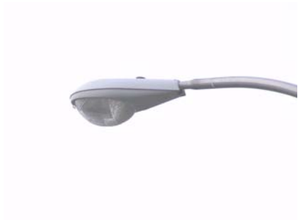
___ Cobra Head Light

Please rank Luminaire Style Options in order from 1 to 3 on the lines provided below (1 being most desirable).