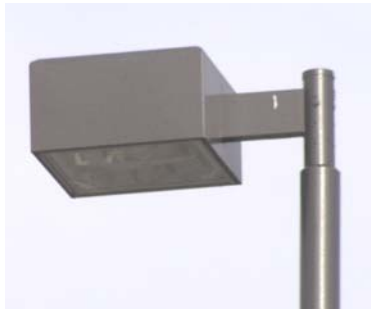
___ Shoebox Light