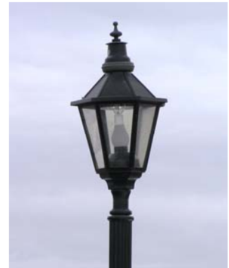
___ Arlington Lantern (Similar to Grandview Square)