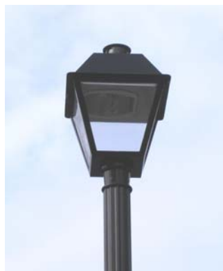
___ Coach Lantern