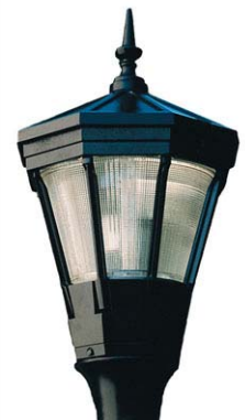
___ Arlington Lantern