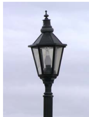
___ Postop Lantern