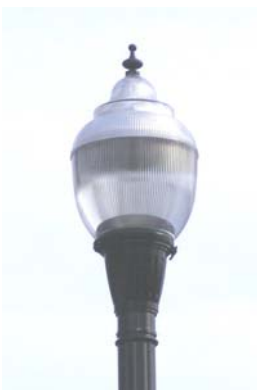
___ Acorn Light

Please rank Decorative Lighting Style Options in order from 1 to 4 on the lines provided below (1 being most desirable).