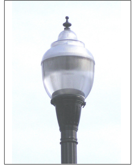
Decorative Acorn Light Option 4

Please tell us which option you prefer by completing the enclosed survey. The surveys must be returned by Friday, May 9, 2008 . A self addressed stamped envelope is enclosed for your convenience.