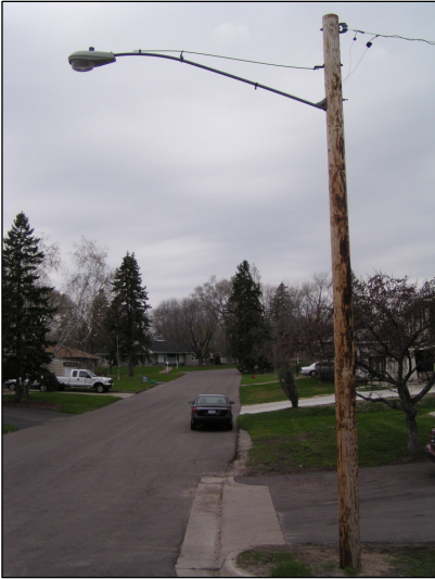
Wooden Pole with Cobra Head Light – Option 1 and 2 (Similar to current pole design)