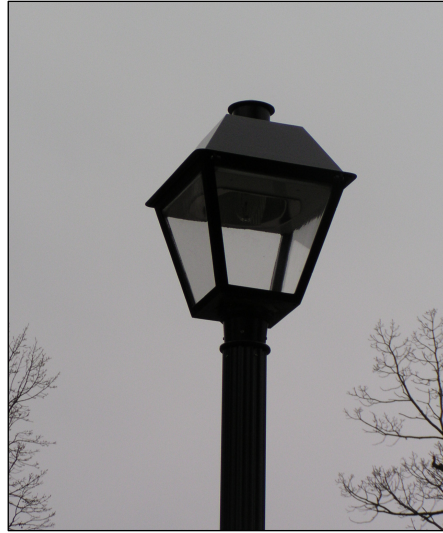
Refurbished Decorative Traditional Lantern – Option 3