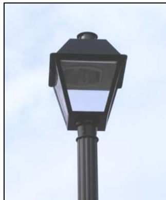
__ Coach Lantern