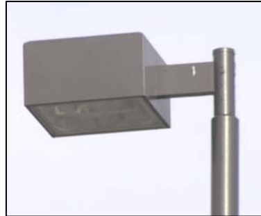
__ Shoebbox Light

Please rank Decorative Lighting Style Options in order from 1 to 4 on the lines provided below (1 being most desirable).