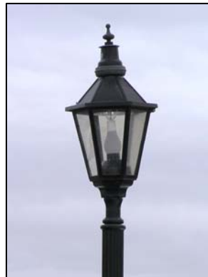
__ Postop Lantern