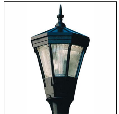
__ Arlington Lantern