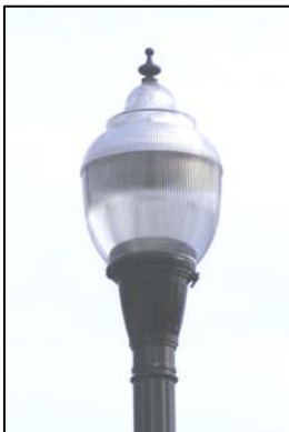
__ Acorn Light

Please rank Decorative Lighting Style Options in order from 1 to 4 on the lines provided below (1 being most desirable).