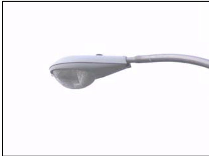
__ Cobra Head Light

Please rank Basic Lighting Style Options in order from 1 to 2 on the lines provided below (1 being most desirable).